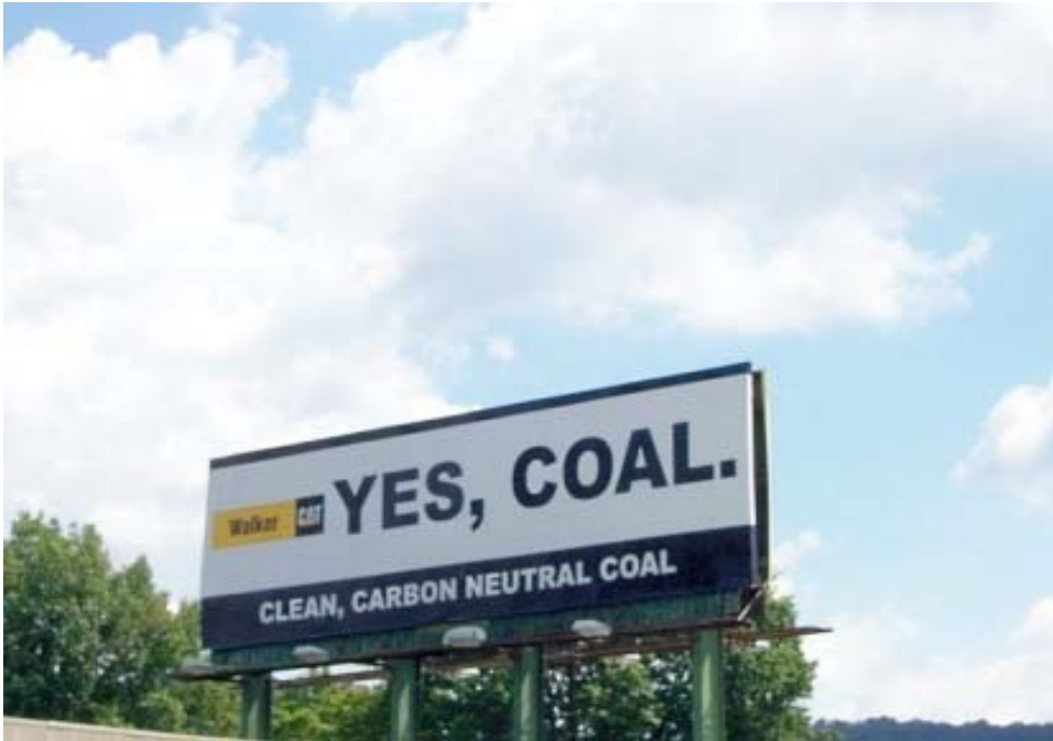
Billboard sponsored by Walker Machinery http://politicalclimate.files.wordpress.com/2008/12/clean-coal.jpg&imgrefurl